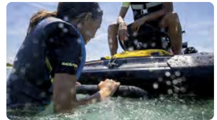
Boarding Ladder Makes boarding from the water easier and quicker.