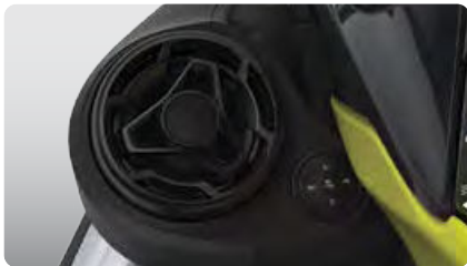
BRP Audio – Premium System (Optional) An industry-first manufacturer-installed truly waterproof Bluetooth® audio system.