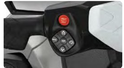
iDF – Intelligent Debris-Free Pump System (Optional) An innovative, industry-first system that allows you to free your pump of weeds and debris with intuitive handlebar-activated controls.