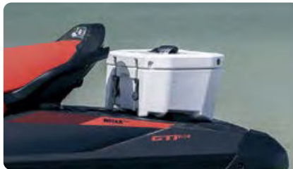
Swim Platform with Integrated LinQ System Exclusive quick-attach system on a large swim platform that allows for easy installation of accessories.