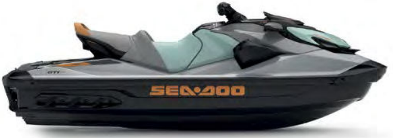
NEW Ice Metal & Neon Mint