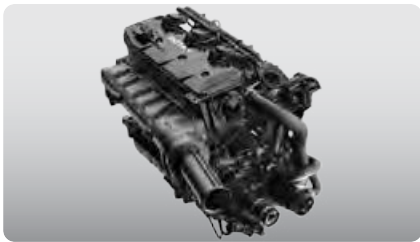
Rotax® 1630 ACE™ – 170 Engines Enjoy plenty of pep and great fuel economy with the 1630 ACE – the most powerful naturally aspirated engine in the Sea-Doo® lineup.