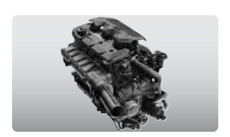
Rotax® 1630 ACE™ – 300 Engine The Rotax 1630 ACE – 300 is the most powerful Rotax engine ever, delivering high efficiency and best-in-class acceleration.