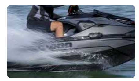
Ergolock™ System A narrow seat profile with deep knee pockets lets riders sit naturally and use the lower body to hold onto the machine for more control.