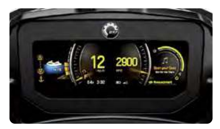
Full-Color 7.8" Wide Display Full-color display with incredible visibility and a new level of functionality. Bluetooth¹ and smartphone app integration provides music, weather, navigation and more.