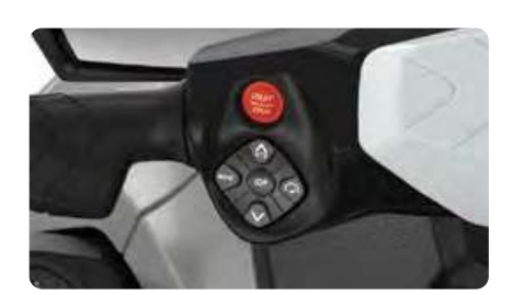
iDF – Intelligent Debris-Free system An innovative, industry-first system that allows you to free your pump of weeds and debris with intuitive handlebar-activated controls.